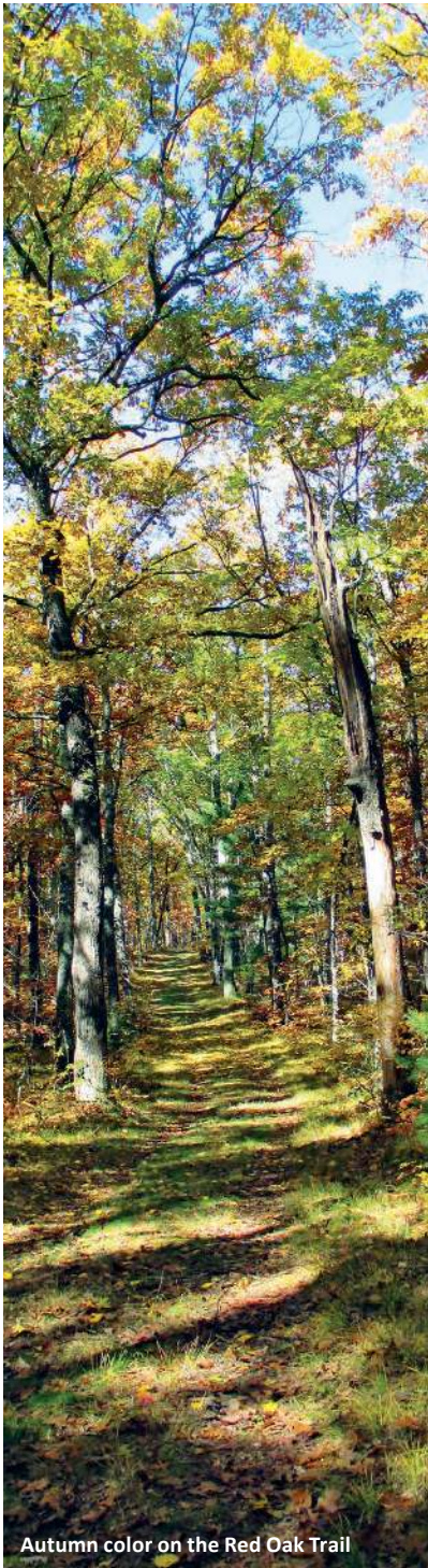
Autumn color on the Red Oak Trail